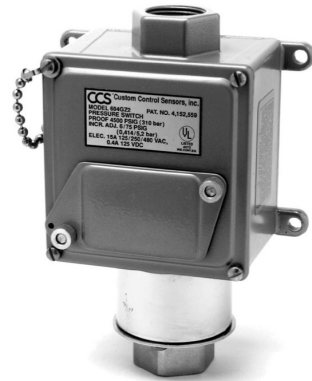
604GZ & 604GZ-7011 SHIPPING WT. APPROX. 52 OZ. (1474 GRAMS)