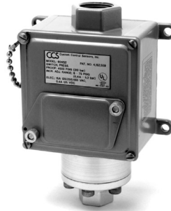
604G & 604V SHIPPING WT. APPROX. 39 OZ. (1092 GRAMS)